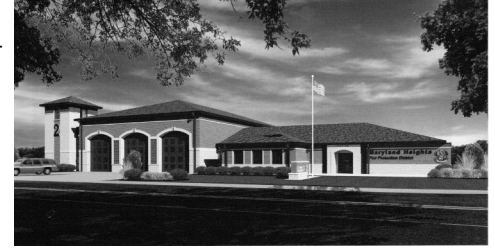
View of the new Maryland Heights firehouse

Maryland Heights does not charge for ambulance service but they will take whatever your insurance will pay. MH Fire Department responds with 4 firemen per truck, and two paramedics per ambulance. If we ask, they will come to any of our meetings to talk further about their services.